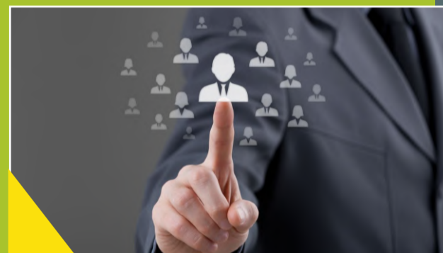
CRM / HRM