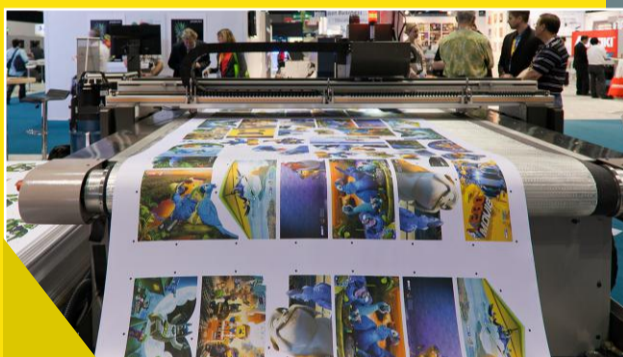
Printing & Publishing